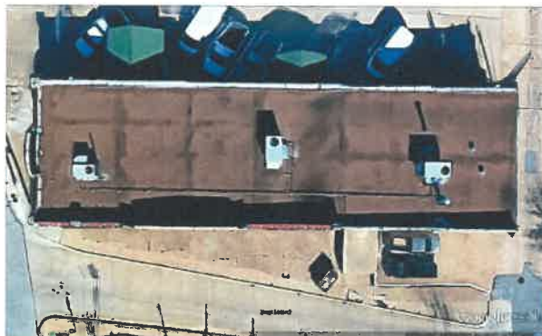
Aerial View of the Tulsa County Carpentry Shop

Per your request and authorization, we have received a photocopy of the Roof Replacement Bids that were received by The Tulsa County Board of Commissioners for the County Carpentry Shop and Tulsa County Courthouse 3 rd Floor on June 2, 2017 and opened June 5, 2017. Please find attached our Bid Tabulation Spreadsheet. On May 16, 2017 representatives of 7 roofing contractors and 2 general contractors met with our firm and Tulsa County representatives in a Mandatory Pre-Bid Conference and roof walk at each building site.