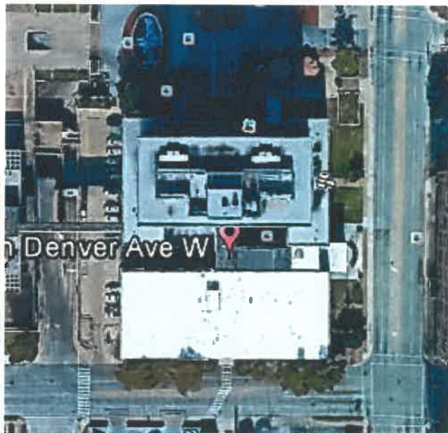
Aerial View of the Tulsa County Courthouse