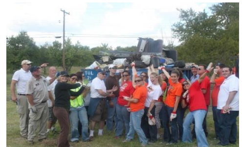
Mayfair Cleanup Group

*Gilcrease Expressway will be breaking ground soon and should be completed in 3 years.