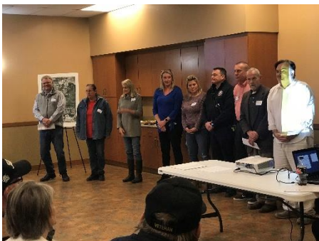
Citizen's Advisory Committee