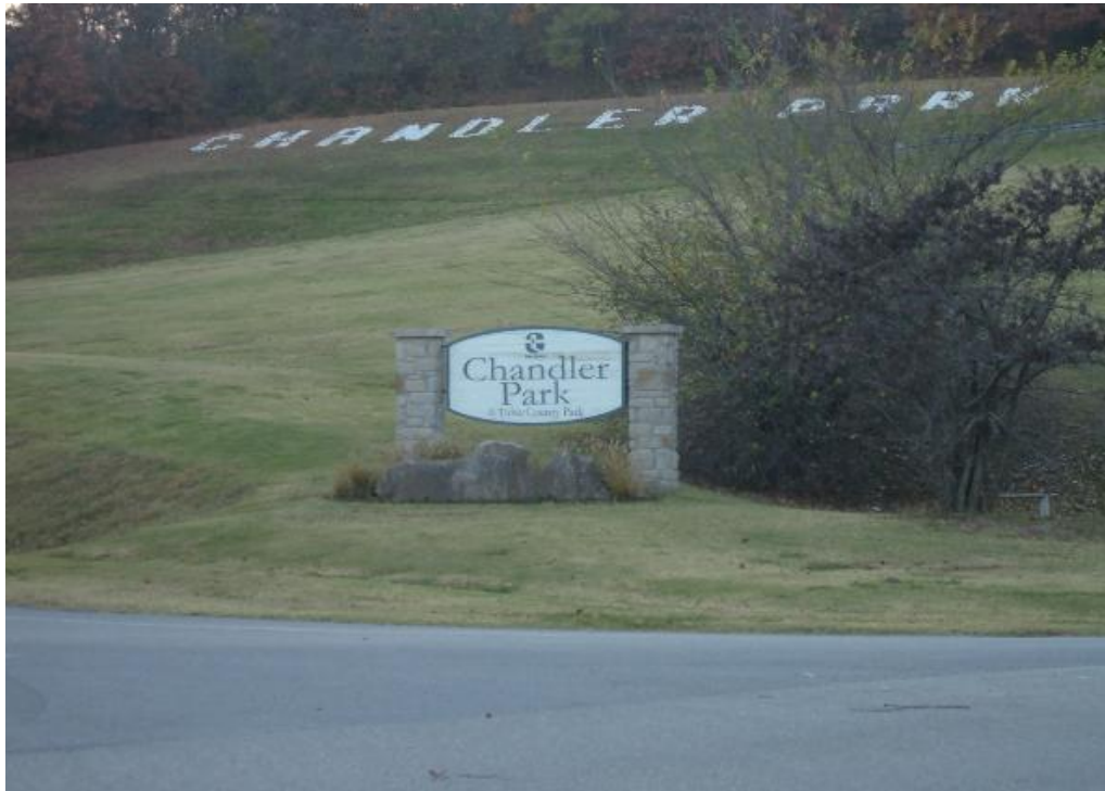
CHANDLER PARK, TULSA, OK