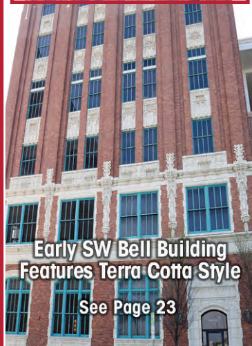
Early SW Bell Building Features Terra Cotta Style