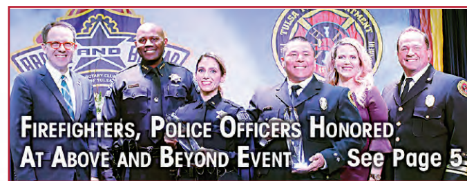
FIREFIGHTERS, POLICE OFFICERS HONORED: AT ABOVE AND BEYOND EVENT