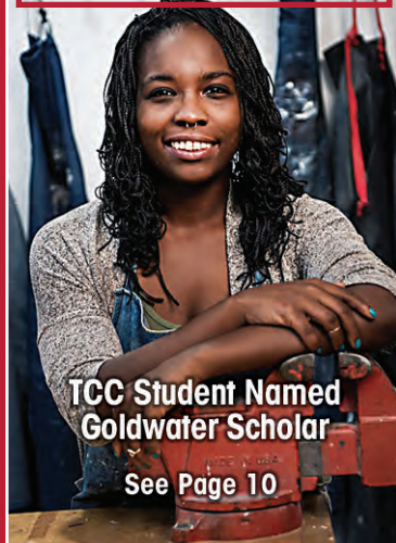
TCC Student Named Goldwater Scholar